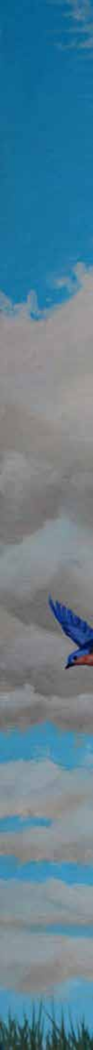
Summer of the Wild Wallflower, 2018 20 x 24" Oil on canvas