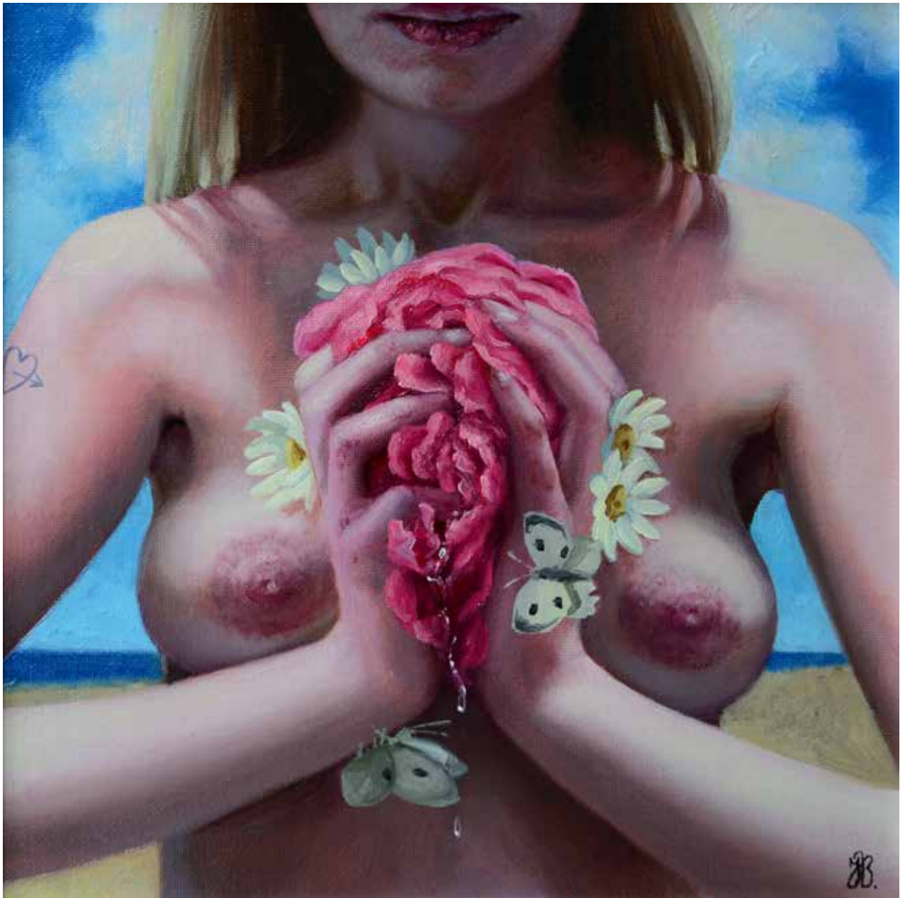
Sacred Heart, 2018 8 x 8" Oil on canvas