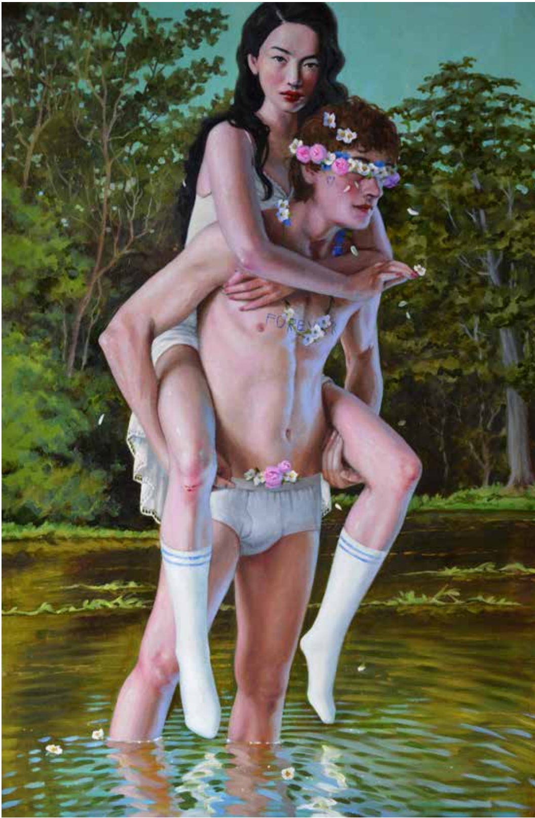
Tour Guide and the Runaway Princess, 2018 16 x 24" Oil on Canvas