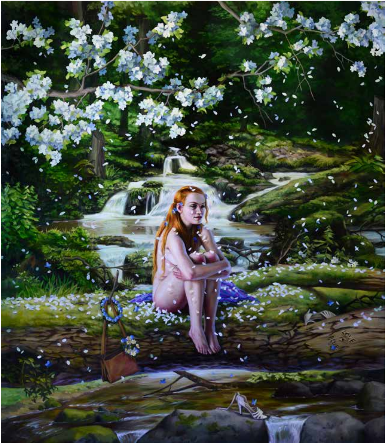
The Deep Waters, 2018 40 x 44" Oil on canvas