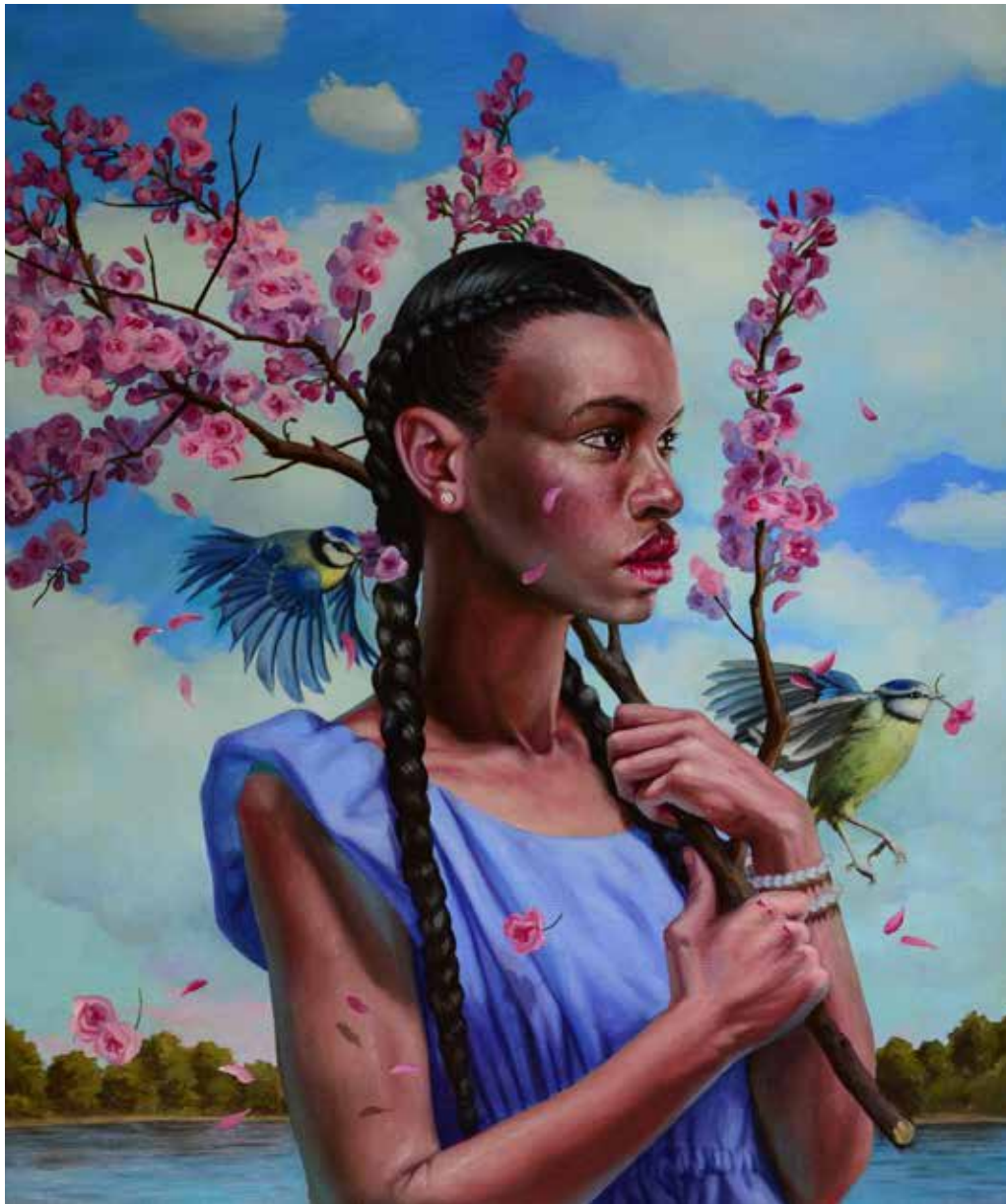
The Procession, 2018 20 x 24" Oil on canvas