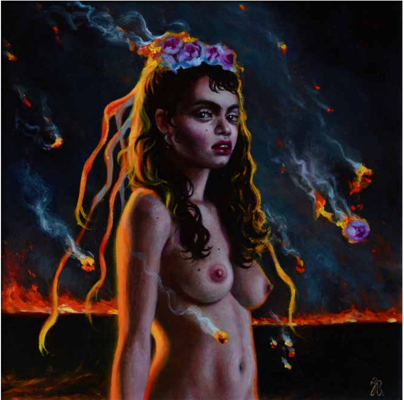
Into The Dark, 2018 8 x 8" Oil on canvas