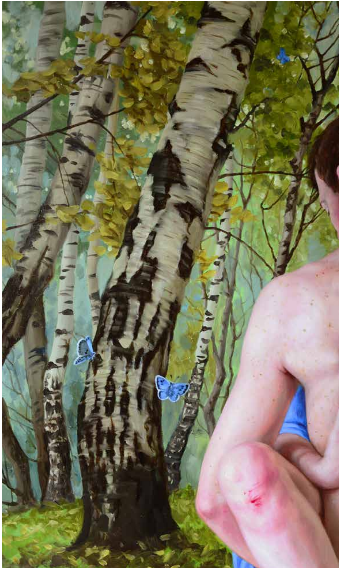
Echos From The Centre Of The World, 2018 24 x 32" Oil on canvas