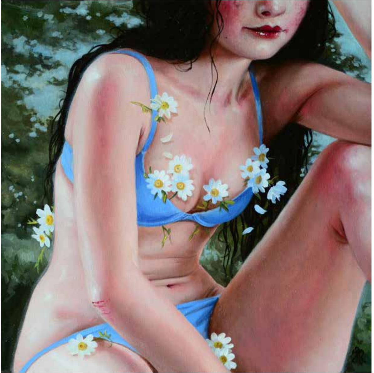
Wild Honey, 2018 12 x 12" Oil on canvas