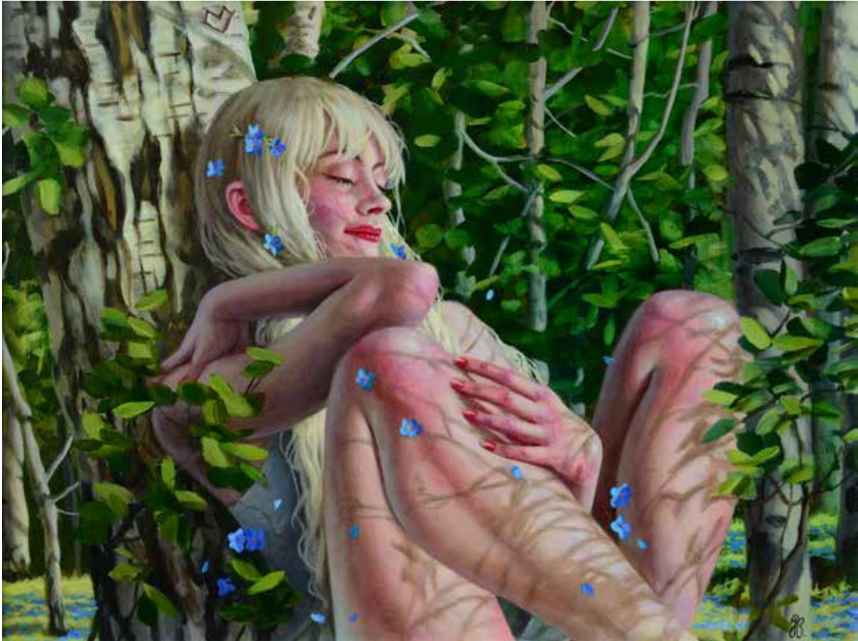
New Day Rising, 2018 11.5 x 15" Oil on canvas