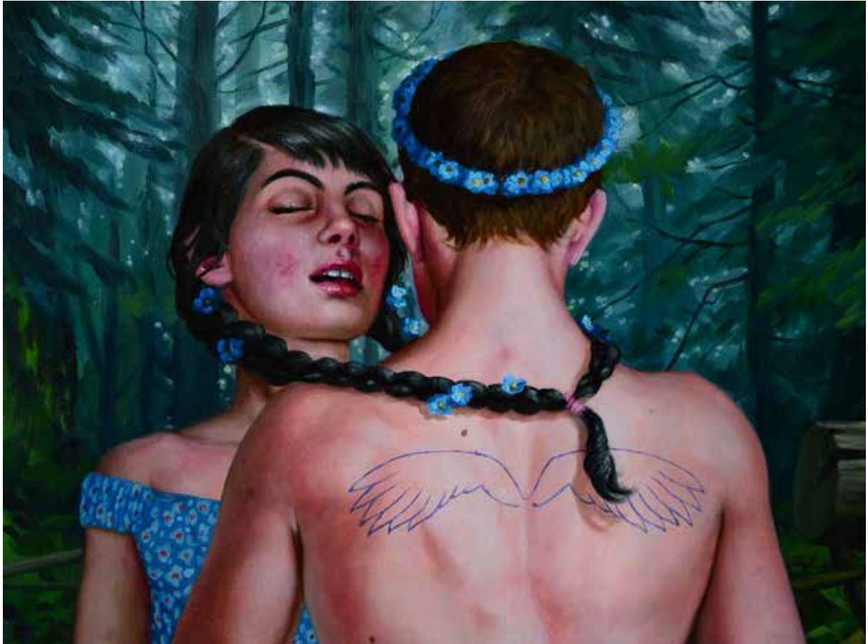
Two Angels In The Deep Dark Woods, 2018 11.5 x 15" Oil on canvas