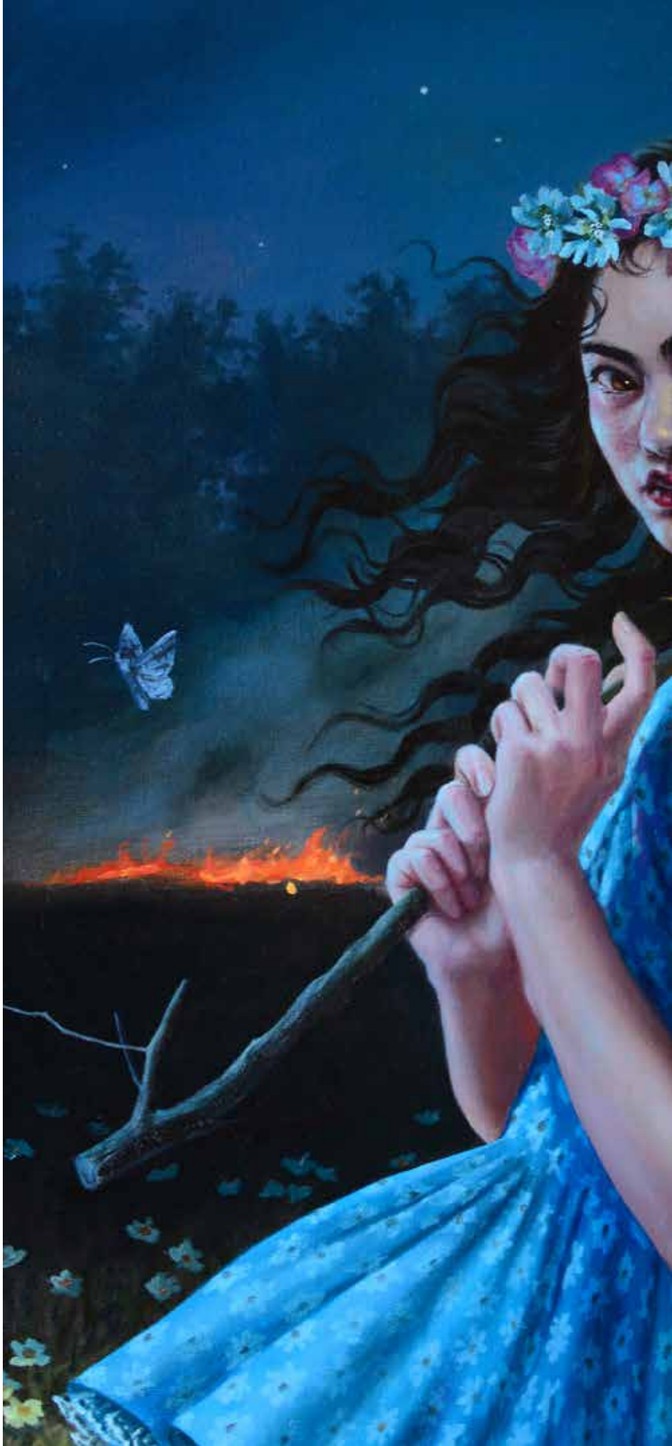
Blood Moon, 2018 20 x 24" Oil on canvas