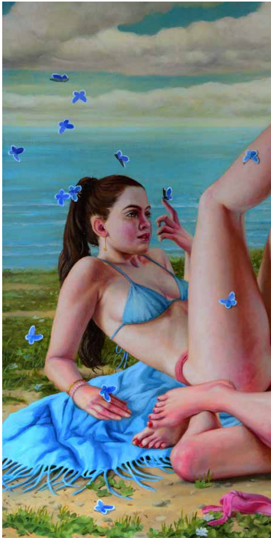
Wildflowers on the Edge of a Cliff, 2018 24 x 32" Oil on canvas