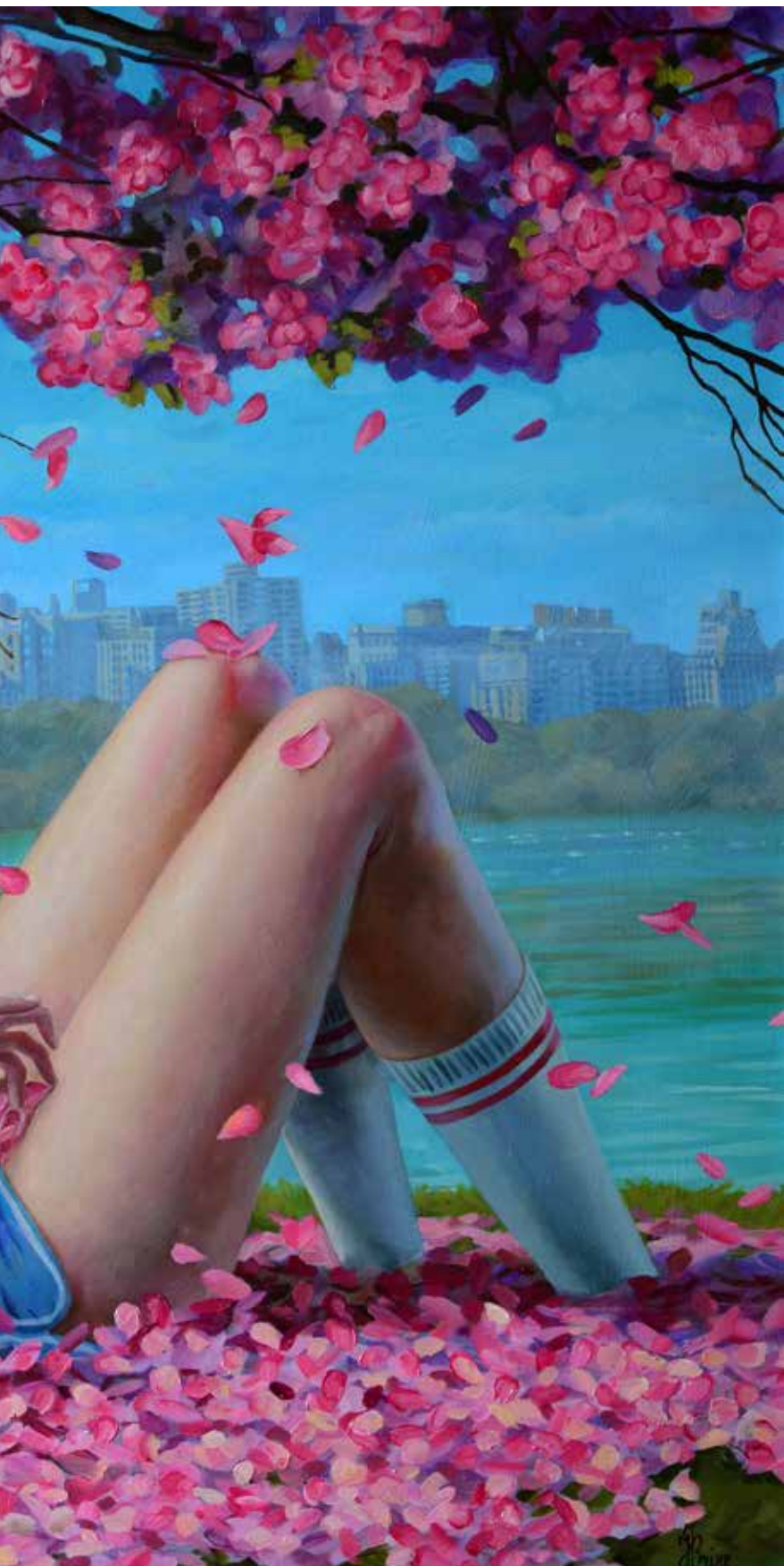
Spring Break, 2018 24 x 32" Oil on canvas